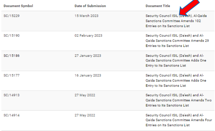
Screen shot F: Press Release webpage.

Step 7: The screen above shows various Press Releases and the dates they were released. The latest being on top. Select any of the Press Release options by clicking on the option and the following screen, which is the actual Press Release summary appears: